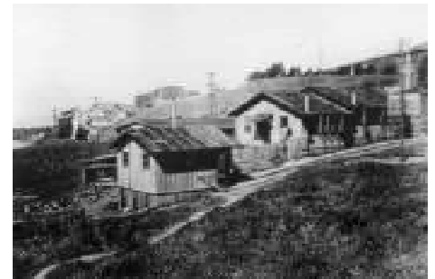
Cragmont School, 1925