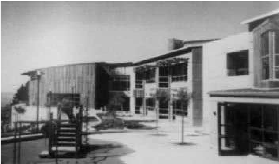
The new Cragmont School 1999.

How many lives does a cat have? Nine maybe? How many lives does Cragmont School have? At least four.